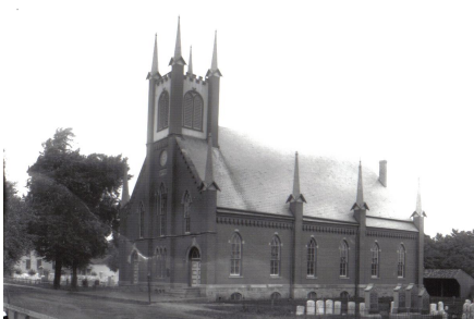
Hamilton Square Baptist Church Circa Sept. 1907

An Old Time Hymn Sing concluded the day to 4:00 pm. All agreed it had been a wonderfully inspiring occasion; enhanced by the beautiful fall decorations throughout the church, lounge and luncheon setting.